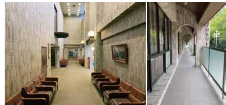
Sumoto Cultural Communication Center