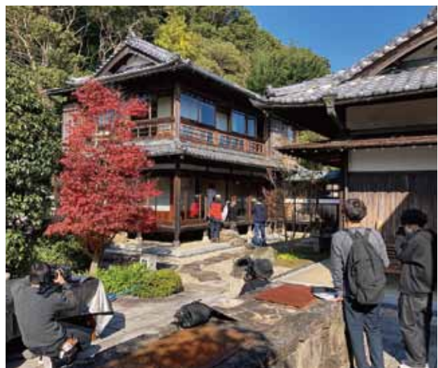
Shunyoso - Historic Landmark