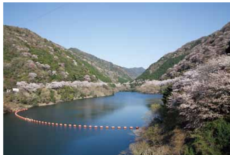
Yuzuruha dam - Cherry blossom spot