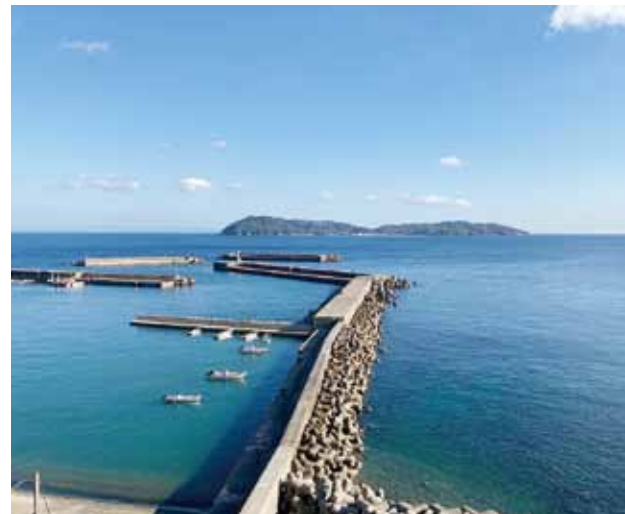
View of Nushima from Habu Port