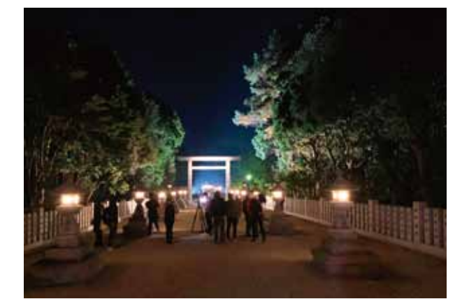
shoot in Izanagi Shrine

ここ淡路島は「国生み神話」の中で、最初に生まれた島と伝えられ、古代から人々がこの地で営み続けてきたという暮らしの証が数多く刻まれています。また、島ならではの特別な風景や素朴な山間部の農村や田畑の姿が昔のまま残っています。現在では、関西都市部からのアクセスが便利な観光地として大人気。週末には多くの観光客で賑わいます。そんな淡路島のロケ地としての魅力を発信していきます。